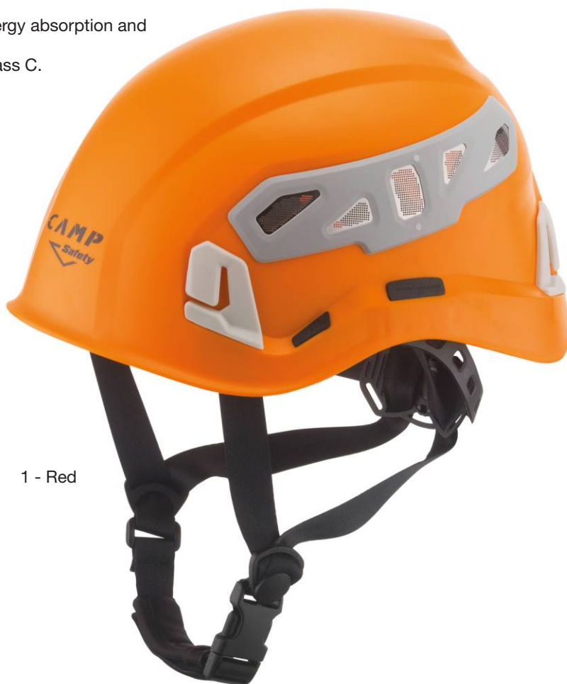
1 - Red

Ares Air ANSI with ANSI visor ref.264201