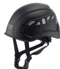
8 - Black