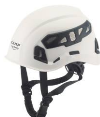
7 - White