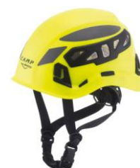
3 - Fluo yellow / Reflective grey