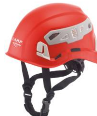
1 - Red