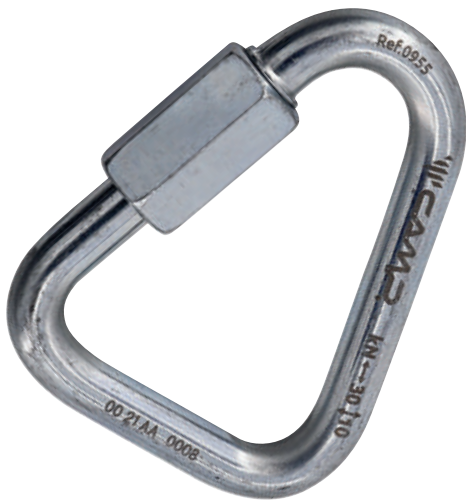
Delta Quick Link Steel 0955 Ø 8 mm

Triangular quick links designed specifically for connecting webbing components. The shape is particularly suitable for the installation of a chest ascender on rope access harnesses.