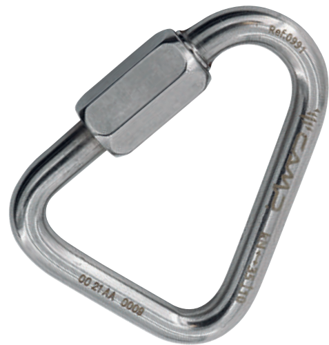
Delta Quick Link Stainless 0991 Ø 8 mm

From stainless steel for outdoor installations or corrosive environments.