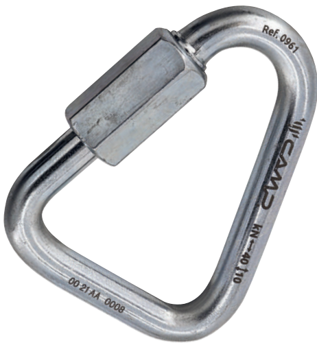
Delta Quick Link Steel 0961 Ø 10 mm

Triangular quick links designed specifically for connecting webbing components. The shape is particularly suitable for the installation of a chest ascender on rope access harnesses.