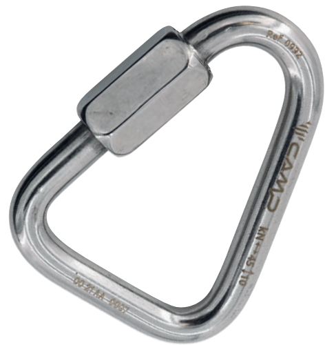
Delta Quick Link Stainless 0992 Ø 10 mm

From stainless steel for outdoor installations or corrosive environments.